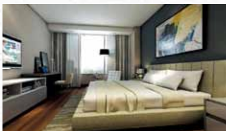
Makati Diamond Residences www.makatidiamond.com

Opening its doors at the heart of the Philippines' business district, the Makati Diamond Residences aims to be the home away from home for business folks looking for a spot to relax and unwind in after a demanding day at work, as well as those who dream of experiencing a luxurious stay in the city without missing the warm comfort of their own abodes.