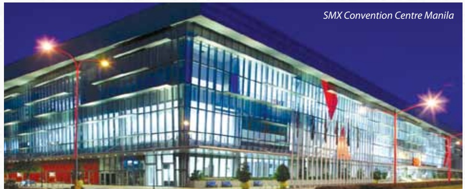
SMX Convention Centre Manila

With just one month away, the international event that features the largest collection of ASEAN tourism products and services will host 400 buyers around the world. The appeal of ASEAN destinations has drawn the interest of global buyers from across 65 countries , with the participation of top markets such as Australia, France, Germany, India, Italy, Malaysia, Poland, Russia, Singapore, United Kingdom and United