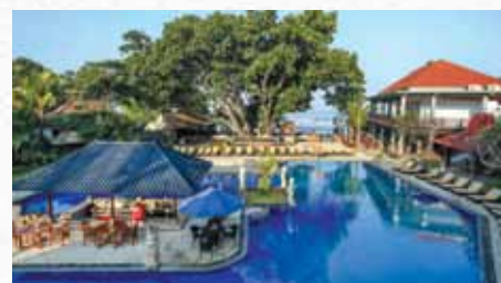
PT. Sol Melia Indonesia (Melia Hotels International), Indonesia Sharon Lee, International Marketing, Jakarta Regional Sales Office

"Puri Saron Seminyak is a beach front hotel in Bali, above your expectations and beyond your wildest dreams. Situated on the prime location of Seminyak Beach, Puri Saron Seminyak offers 115 rooms and pool villas, big swimming pool, restaurants and bars, massage and spa, free WiFi, internet café, a magnificent ball room and 3 meeting rooms, all provided for your meeting, conference, exhibition, wedding and special celebrations."