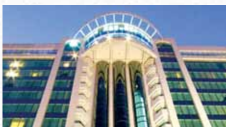
Pan Pacific Manila www.panpacific.com/en/hotels-resorts/philippines/manila.html

Nobu Hotel is a luxurious hotel at the bayside within the Entertainment City which is strategically located 3 kilometers away from the Ninoy Aquino International Airport (NAIA). It is 5 minutes drive from SM Mall of Asia (MOA) and SMX Convention Center.