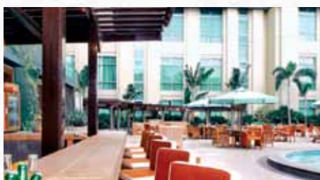
New World Manila Bay Hotel www.manilabay.newworldhotels.com/en

This de luxe hotel in Makati is located just 20 minutes away from the airport. It is a luxurious sanctuary for both business and leisure travellers. The hotel is within walking distance from some of the most popular shopping malls in Manila such as Glorietta, Greenbelt and SM Department Store.