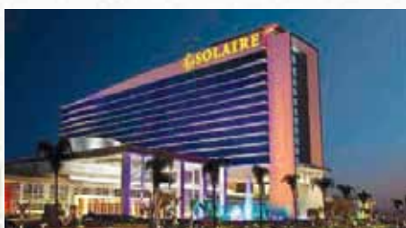
Solaire Resort and Casino www.solaireresort.com

The calm, modern elegance of our Pan Pacific hotel in Manila eases the mind and refreshes the senses. Famed for personal and effortless service, Pan Pacific Hotel in Manila is a place where tradition meets modernity. Expect a memorable luxury experience when you stay in our delightful hotel.