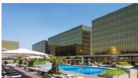
Nobu Hotel City of Dreams www.nobuhotelmanila.com

Enjoy the convenience of easy access to the international airport, business district, the largest shopping center in the city, and popular entertainment destinations. Business and leisure guests will appreciate New World Manila Bay Hotel's calm atmosphere, efficient service, and personal attention that are paid to their comfort and well-being.