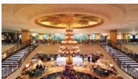
Makati Shangri-la Hotel www.shangri-la.com

Opening its doors at the heart of the Philippines' business district, the Makati Diamond Residences aims to be the home away from home for business folks looking for a spot to relax and unwind in after a demanding day at work, as well as those who dream of experiencing a luxurious stay in the city without missing the warm comfort of their own abodes.